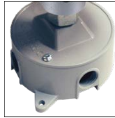
Optional Low Surface Mount