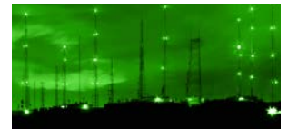
Night Vision Compatible version available. See flightlight.com for details.