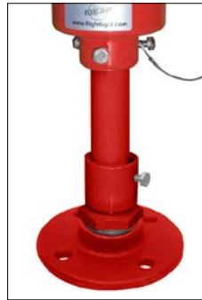
Shown with Riser, Frangible Coupling and Floor Flange